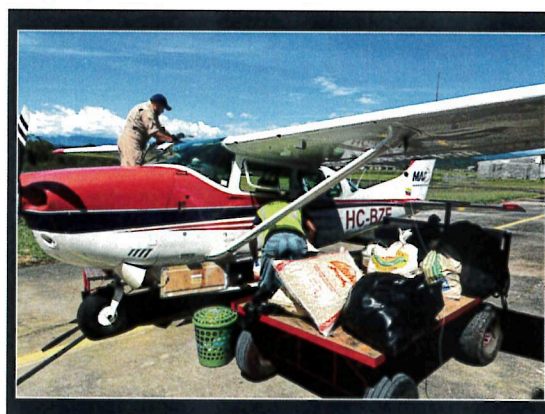
One of MAF Ecuador's 206s ready to head into jungle villages with supplies