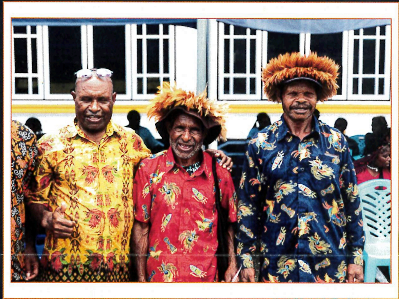
Members of the Ngalik Bible translation team