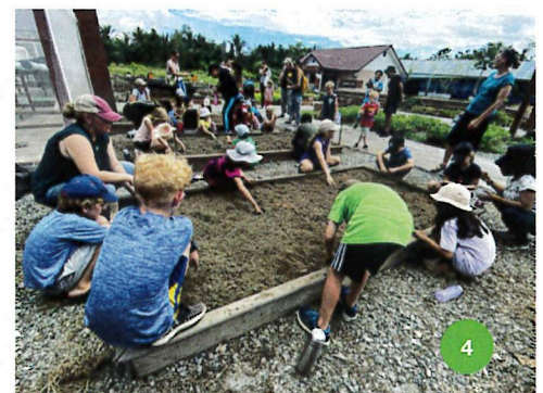
Students planted kangkung seeds in the garden boxes.