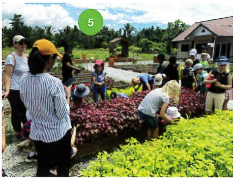
A favorite part of the day was harvesting the spinach.