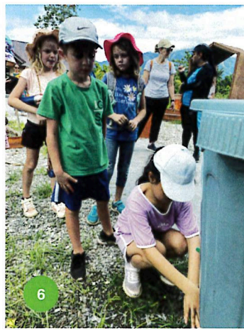
Don't forget to wash your hands after playing in the dirt!