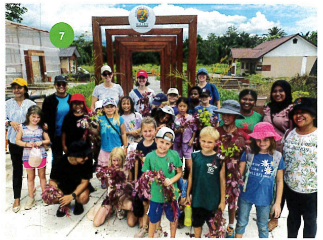
Lots of big smiles at the end of a sunny day.

What were my takeaways? 🌱 I am grateful for the vocational and life lessons I gained