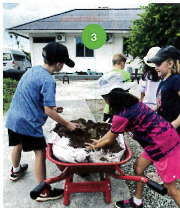
Students got their hands dirty as they learned about fertilizer.