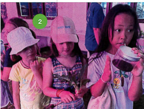
Students identified plant parts and viewed a leaf under a microscope.

are available for elementary kids in Papua? In the past, elementary students from HIS have taken field trips to the fire department, post office, MAF and YAJASI (JAARS' aviation affiliate in Indonesia) hangars, and even a chocolate “factory.” This year, however, a new field trip location was brought to our faculty's attention. Waibu Agro Edu Tourism is an organization that encourages classes to come to their property to learn about agriculture! The field trip did not disappoint. While I could spend pages giving dry descriptions of how we spent our morning, I think pictures will do the day and the place more justice.